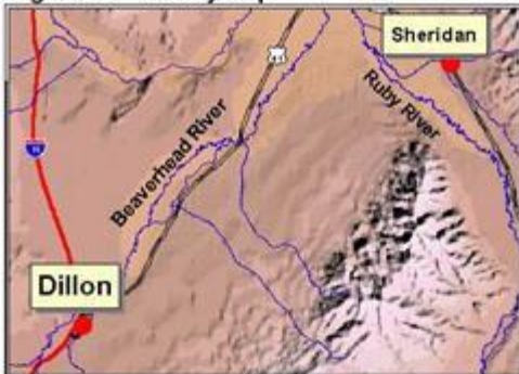
Figure 1A - Vicinity Map